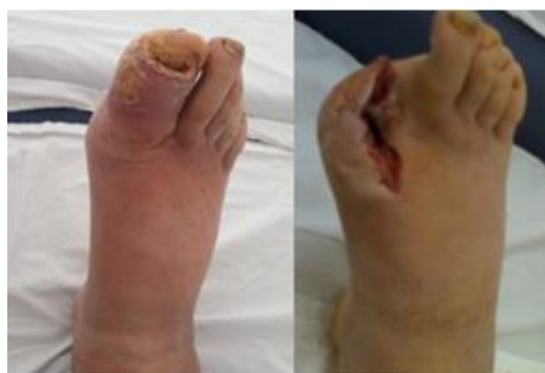
Figure 1. Hallux necrosis and osteitis of the right foot-necessity of amputation and secondary closure

In patients with toe necrosis or osteitis, amputation was necessary. The patients usually come in an advanced stage with leg infection and empiric antibiotic treatment is started after drawing wound cultures. After amputation, the defect is left open for 3-4 days, being sutured when the inflammatory signs disappear.