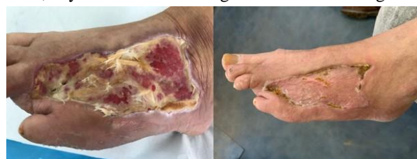
Figure 2. Patient with ulceration on the dorsal part of the foot covered using a split skin graft.

Ulcerations present on the dorsal part of the foot are usually covered by using a skin graft, especially when the defect is large and the leg vascularization is poor. The reconstruction is performed when the wound cultures are sterile, any bacterial load being a threat to the skin graft.