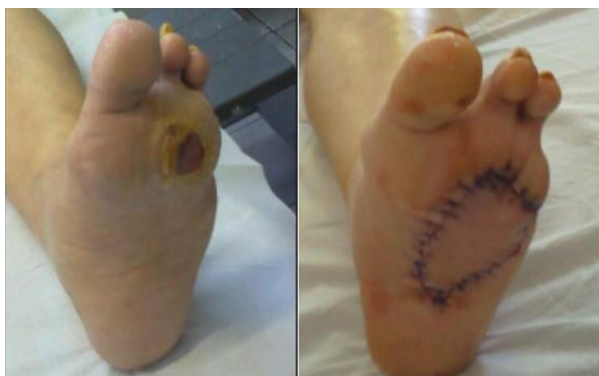
Figure 4. Plantar ulcer covered by using a local advancement flap.

Plantar ulcers usually appear over the pressure areas and that is why they are so difficult to treat. Sometimes, patients refuse surgery and the only solutions are dressings and secondary healing. Every patient with ulceration requires a radiography because this could hide an osteitic process. Secondary healing is usually time and money consuming regarding the frequency and the necessity of special dressings that are used, such as polyhexanide solution or polyurethane foam (8, 9).