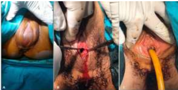
Figure 2. (A) Image of the bulging hymenal tissue during gynecologic examination. (B) Appearance of the incision. (C) Image of the inserted Foley catheter at the end of the operation.